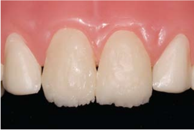
Figure 9: A second dentin replacement layer in shade B1 was placed in the middle half of the central incisors and extended to begin dentinal lobe development.