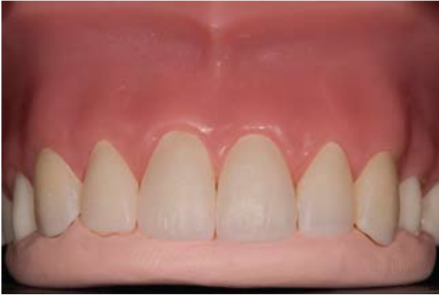
Figure 27: Since the PVS matrix was used for development of the incisal edges, note that a true fit was confirmed during assessment of the restorations.