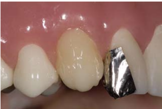
Figure 21: The initial dentin replacement layer (cervical shade A2) was placed in the gingival half of teeth #6 and #11 and extended partially into the incisal half.