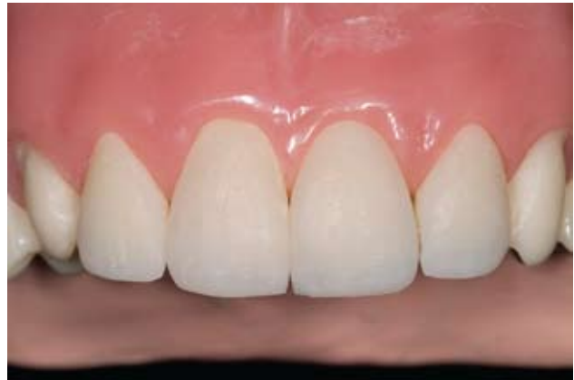
Figure 20: The widths of the newly fabricated restorations were assessed in three areas—gingival, middle, and incisal—to ensure harmony and balance.