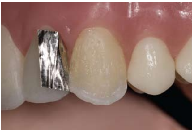
Figure 25: On tooth #11, a mixture of Vital blue 30% and 70% clear tints was applied to the incisal zone to create incisal translucency.