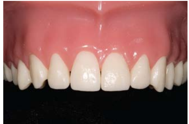
Figure 2: Preoperative view of a typodont model. In a clinical scenario, a diagnostic mock-up would be analyzed to plan the case.

The build-up or layering technique itself is one reflective of ceramist's principles. These use materials to interplay with light and recreate the hues, chromas, and values of color inherent to the tooth structure being replaced. 2 The direct composite build-up steps represent a process for completing a layered restoration similar to one fabricated with ceramic to replace dentin, enamel, dentin lobes, and characteristic colors. Mastery of these techniques forms the basic foundation for creating lifelike restorations, the quality of which is limited only by the imagination.