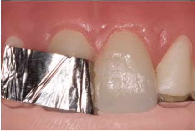
Figure 13: A final enamel layer in composite shade Pearl Frost was applied. Proper isolation with a dead soft matrix facilitates this process.