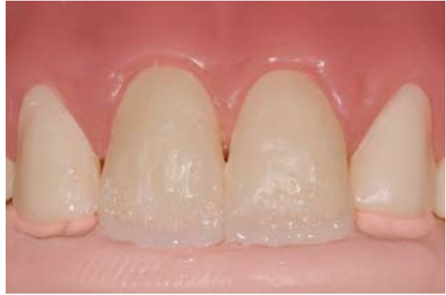
Figure 10: The remaining lingual contour and incisal plane was recreated by applying Opaque Snow composite, with the matrix as a guide.