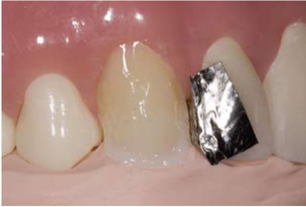
Figure 23: The remaining lingual contour and incisal plane was recreated by applying Incisal Edge Opaque Snow composite to teeth #6 and #11.