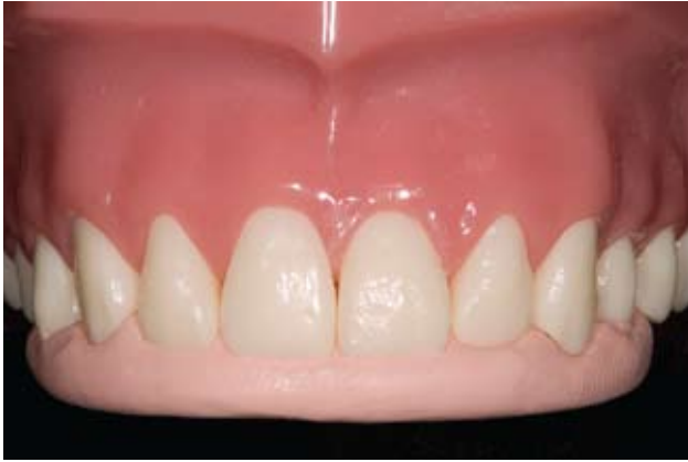
Figure 5: A PVS matrix must include the facial-incisal line angle to aid in the fabrication of the designed incisal edge plane and contour.