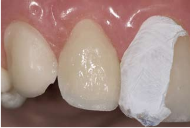
Figure 17: Iridescent Blue composite was applied to tooth #7 to create incisal translucency.