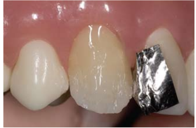
Figure 24: Cuspids tend to have less incisal translucency effect. On tooth #6, Iridescent Blue composite was applied to create incisal translucency.