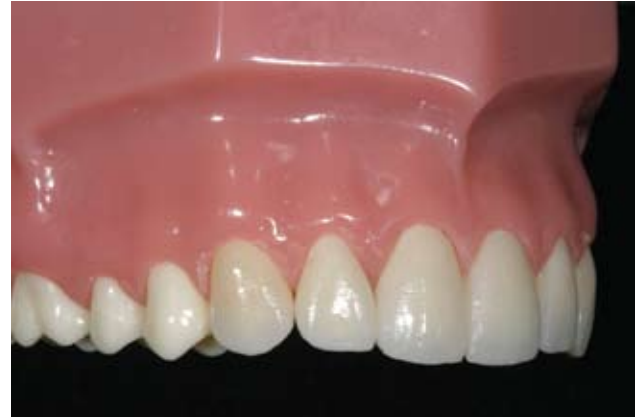
Figure 32: Note the gradation of color using the parameters of value and chroma moving from the central to the lateral to the cuspid.