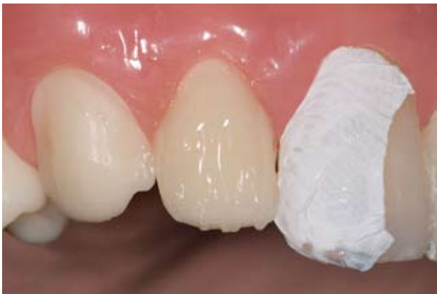
Figure 15: The initial dentin replacement layer (cervical/body A1 composite) was applied to teeth #7 and #10 in the gingival half almost to full contour.