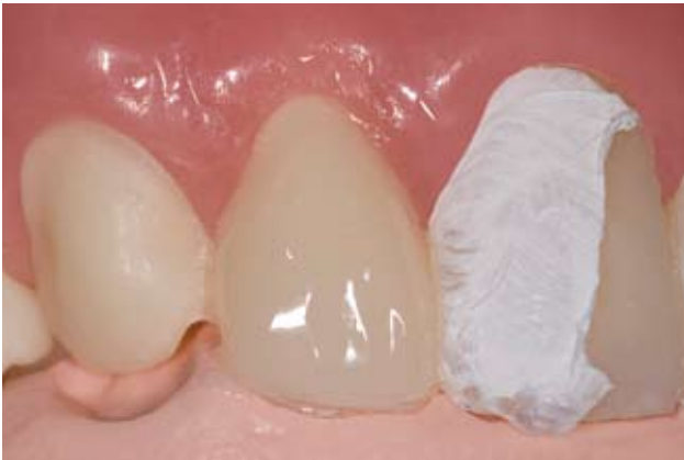
Figure 19: The final enamel layer of teeth #7 and #10 was applied in composite shade Pearl Frost.