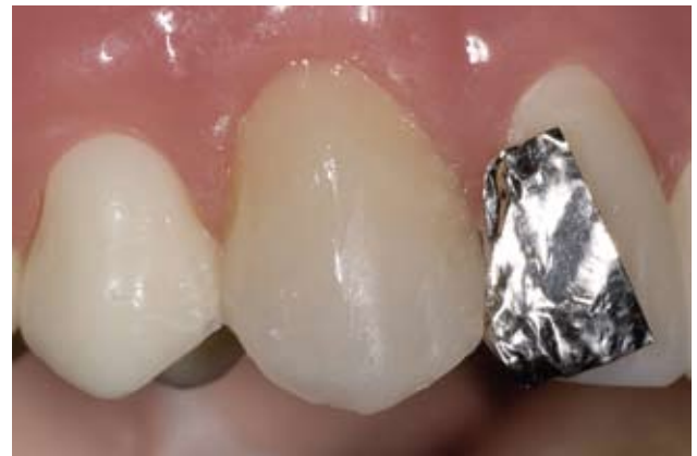
Figure 26: The final enamel layer of teeth #6 and #11 was created by applying Final Enamel Shade Pearl Neutral composite.

come more well-defined (e.g., secondary anatomy, tertiary anatomy) (Figs 29 & 30). To this end, it is important for clinicians to have a logical, sequential, and predictable method of finishing and polishing (e.g., UCLA LeSage Anterior Aesthetic Restorative System, Brasseler USA [Savannah, GA]; Jiffy [Ultradent]) that ultimately leads to a restoration surface that is ready to accept and reflect light, not one full of voids and defects, stains and pits. For example, a green striped diamond (#6856L-020) in a slow-speed, air-driven handpiece (NSK, Brasseler) can be