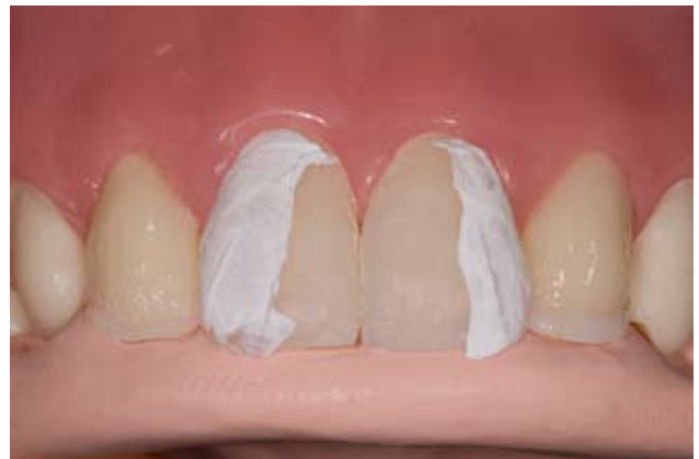
Figure 16: The remaining lingual contour and incisal plane of teeth #7 and #10 was recreated by applying Opaque Snow composite.

first, followed by the lateral incisors, then the canines. That being said, when the central incisors have been developed to approximately 80% to 90% of full contour, they should be assessed in terms of width and length symmetry, line angles, and harmonious balance (Fig 14). Calipers can facilitate this process. Once harmony and balance are confirmed, the restorative layering process can proceed to the lateral incisors (Figs 15-19). Similarly, when those restorations have reached approximately 80% to 90% of their full contour, they too should be assessed (Fig 20). Finally, the cuspids can