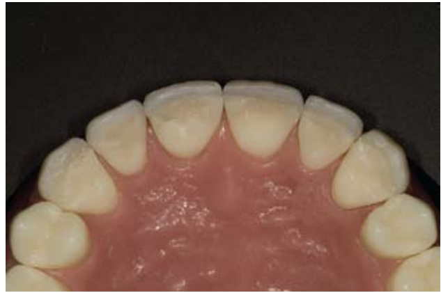
Figure 30: Incisal view of the final restorations. Clinicians should see well-demarcated line angles and a similar amount of facial surfaces and anatomy on contralateral restorations.

dentin and enamel in different parts of the tooth; and how to vary the hue, chroma, and value of the composite restorations that are systematically layered. The keys to success are observation and strategic control, and careful selection and manipulation of the desired composite material. Additionally, on an AACD Accreditation Case Type V, it is essential to use a comprehensive restorative system that provides all the requisite shade opacities, translucencies, and dentin and enamel colors and tints (e.g., Vitalescence; Premise, Kerr [Orange, CA]; 4 Seasons, Ivo-