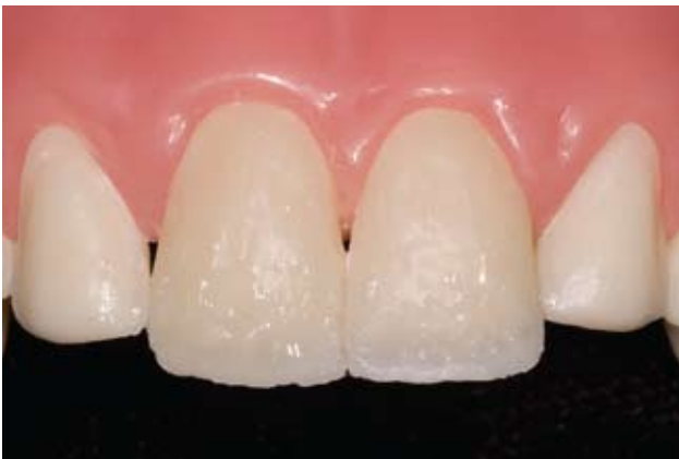
Figure 11: Iridescent Blue composite was applied to tooth #8 primarily between the previously formed dentinal lobes to create incisal translucency.