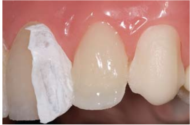
Figure 18: A mixture of Vital blue 30% and 70% clear tints was applied to the incisal zone of tooth #10.