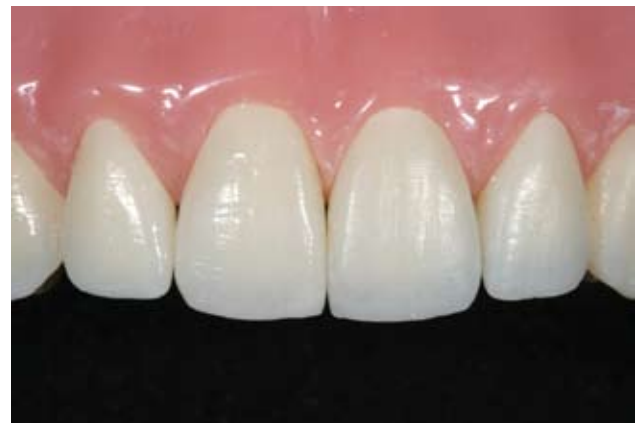
Figure 33: Use goat hair brushes and chamois wheels with wet and dry composite polishing paste; as seen on the right side of the tyodont, a high polish is attainable.