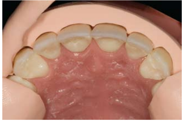
Figure 28: Incisal view of the polyvinyl siloxane matrix. Note the proximity of the matrix and the facial contour of the final restorations in the gingival half.