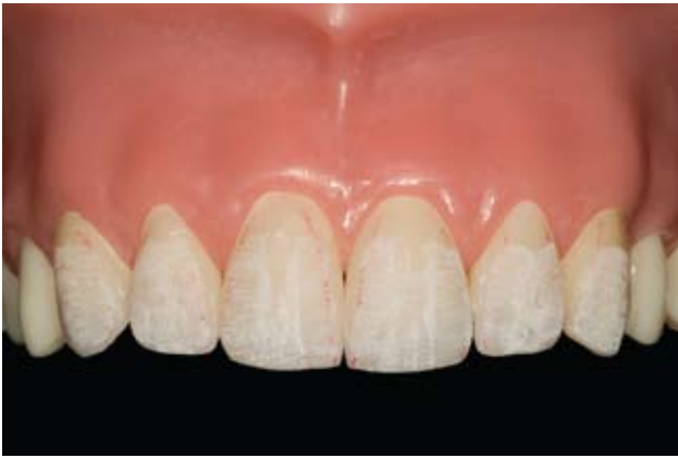
Figure 29: Faint red lines scribed on the composite outline the transition line angles. Texture can be carried to and beyond the line angles to simulate nature.