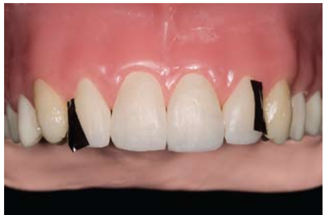
Figure 22: A second dentin replacement layer (body shade A1) was placed in the middle half of teeth #6 and #11 and extended to begin dentinal lobe development.