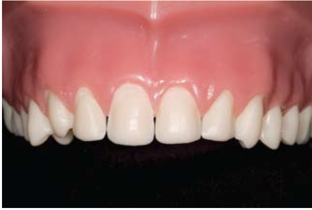
Figure 3: Facial view of teeth #6-11, demonstrating an aggressive preparation on a typodont.