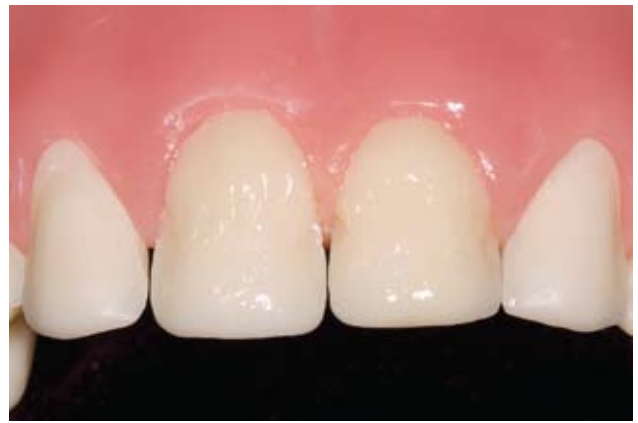
Figure 8: The initial dentin replacement layer (shade A1) was placed in the gingival half of the central incisors and extended partially into the incisal half.

dent Products; South Jordan, UT) in the gingival half of the tooth, almost to full contour. Extend this composite layer partially into the incisal half and light-cure as directed by the manufacturer (Fig 8).