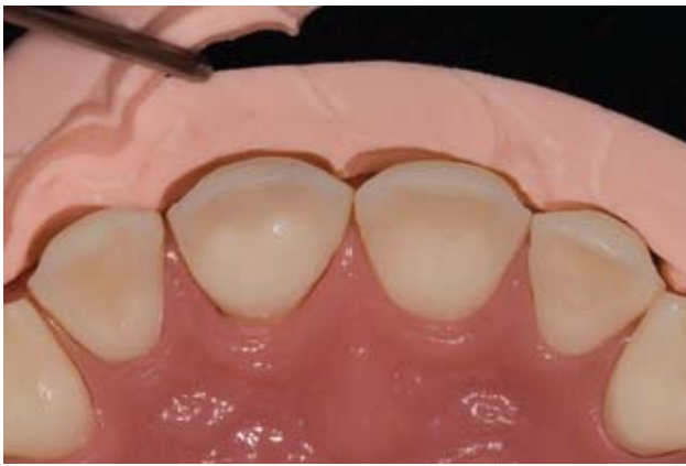
Figure 7: Close-up view of the reduction matrix after preparation confirms that the desired reduction was achieved.