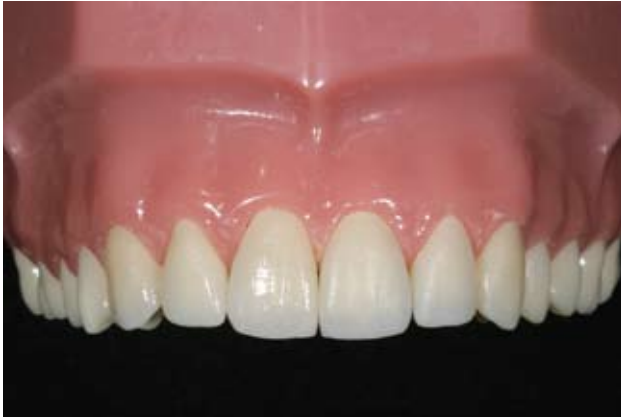
Figure 31: Using rubber points, cups and wheels, a disc system, and a silicone impregnated brush, clinicians can attain a luster and polish appropriate for individual cases.