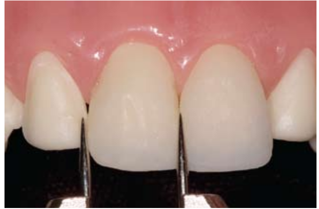
Figure 14: Calipers were used to measure the widths of the newly fabricated restorations in three areas—gingival, middle, and incisal—to ensure harmony and balance.