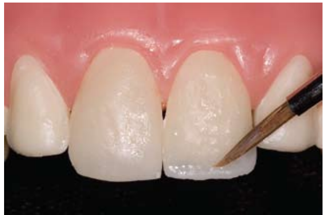
Figure 12: A mixture of Vital blue 30% and 70% clear tints was applied to the incisal zone to establish the appropriate incisal translucency.