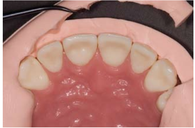
Figure 6: Incisal view of the reduction guide that will be used to confirm appropriate and uniform reduction and appropriate and harmonious contours in the final restorations.