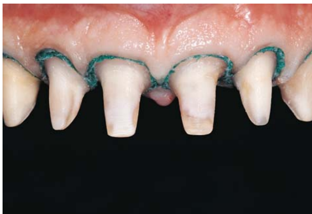
FIGURE 5. The second cord layer must be visible 360 degrees around the finish line for effective lateral tissue displacement.