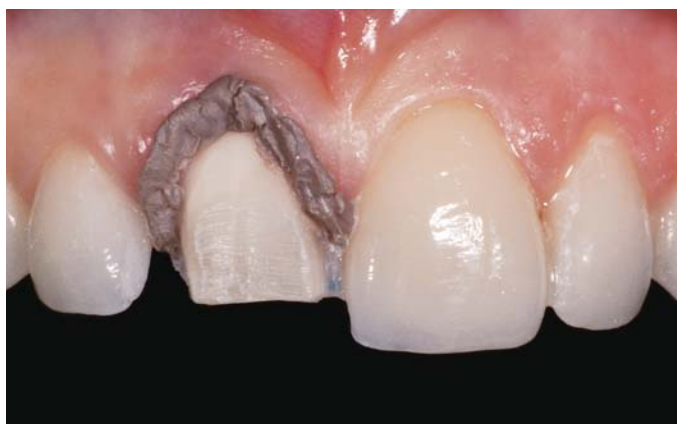
FIGURE 11. Preoperative view upon initial preparation of tooth #8(11). Tissue retraction was obtained using a cord replacement material (Expa-syl, Kerr/Sybron, Orange, CA).

§Director, UCLA Aesthetic Continuum, Levels I and III and Co-director Level II, UCLA School of Dentistry, Los Angeles, California; private practice, Beverly Hills, California.