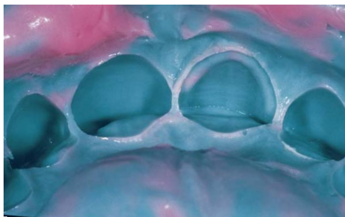
FIGURE 12. A reversible hydrocolloid impression was taken. Note the extension of impression material well beyond the defined margins.