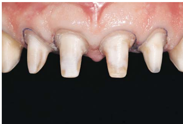
FIGURE 4. The initial retraction cord layer was atraumatically placed. Care was taken to maintain the gingival contour and avoid impingement of the attachment apparatus.