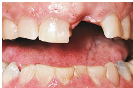
FIGURE 7. An ovate pontic form is indicated for the maintenance of aesthetic soft tissue harmony.

The development and application of pulsed (eg, Nd:YAG, American Dental Technologies, Southfield, MI) and diode (eg, Waterlase, Biolase, San Clemente, CA) lasers have resulted in significant advancements in soft tissue manipulation. In addition to their proven efficacy in soft tissue contouring, recent developments have resulted in the application of diode lasers for a variety of functions that include cavity preparation, caries removal, and tooth etching. Laser soft tissue management systems facilitate the elimination of