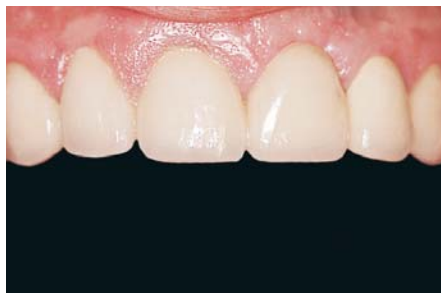
FIGURE 10. Once an appropriate healing and provisionalization period has been observed, the definitive restorations can be placed for an aesthetically enhanced tissue appearance and health.

tooth position and prevents shifting of the hard and soft tissues during laboratory fabrication of the definitive restorations. Provisional restorations function as a prototype to determine the accurate length, contours, relationship, midline, incisal edge anatomy, gradation of color, central dominance, embrasure forms, axial inclinations, surface anatomies, and textures. Patients are awarded the opportunity to communicate any desired modifications that may be necessary prior to delivery of the final restorations, and