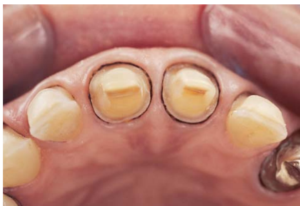
FIGURE 1. Adequate subgingival tissue retraction is essential to the preservation of the soft tissue architecture during impression taking.