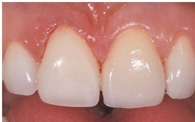
FIGURE 14. A bis-acrylic provisional restoration was fabricated and demonstrated precise contours and polish. Minimal tissue trauma was evident.