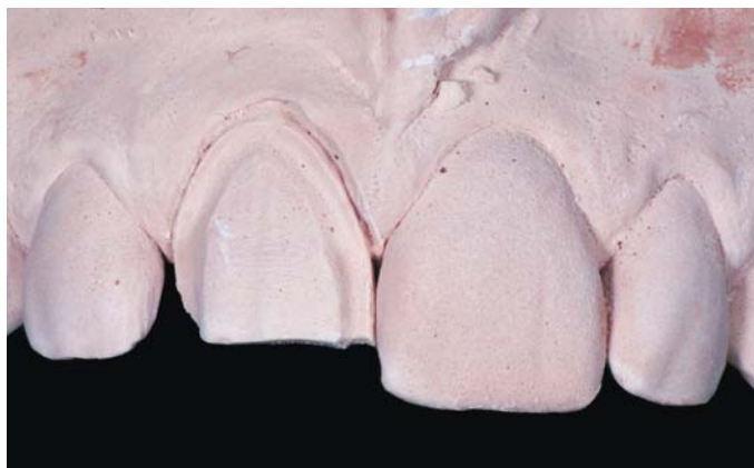
FIGURE 13. Based on the information obtained during the impression-making phase, precise models of the existing tissue architecture can be created. The die model of tooth #8 demonstrates a clear and readable chamfer margin.