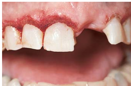
FIGURE 9. Laser gingivectomy was performed prior to provisionalization and hemostasis was maintained.

pain and bleeding while removing bacteria from damaged gingival tissues. While traditional laser systems have resulted in excess alteration of the gingival interface with unpredictable results, the increased application of contemporary laser devices allows the clinician to perform reliable, consistent soft tissue surgery for subsequent aesthetics and tissue integration.