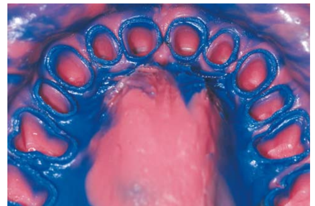
FIGURE 6. A definitive full-arch impression accurately captured hard and soft tissue architecture of the 12 consecutive abutments.