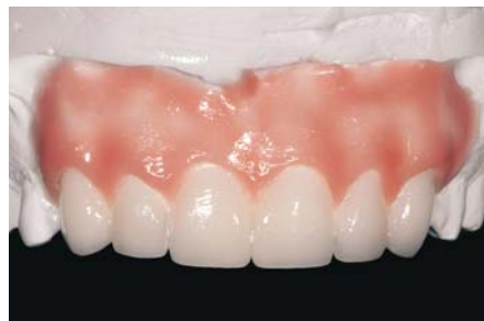
FIGURE 8. Diagnostic waxups can be used on mounted models for patient consultation and acceptance of the desired outcome.

The placement of provisional restorations enables maintenance of the